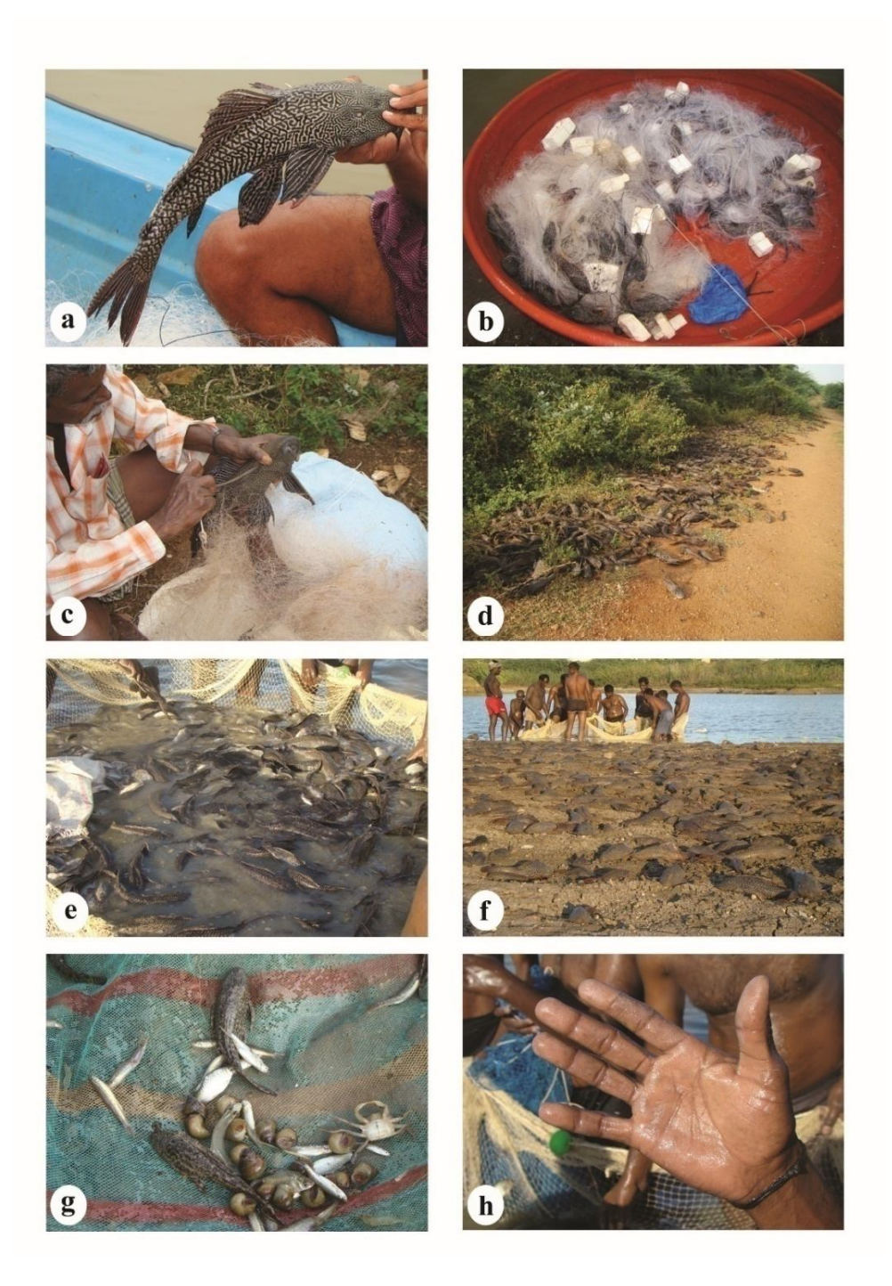
Fig. 2: Manual Control of Pterygoplichthys pardalis by local fisherman. a , P. pardalis caught in Vandiyur Lake. b , Catching of P. pardalis in fishing net. c , Difficulty in removal of P. pardalis from the nets. e , Non-edible P. pardalis fish species were thrown along the lake banks. f , Mass eradication of P. pardalis . g , People involvement in P. pardalis eradication. h , Allergy caused by the mucus of P. pardalis in fisherman's hand.