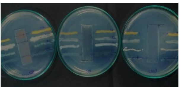
Fig 3. AST plates [left to right] of Green CuNPs, synthetic NPs, and control [Ampicillin]

Ecofriendly Green nanoparticles showed weaker inhibition in comparison to synthetically prepared nanoparticles. In the present studies aconitum nanoparticles showed strong inhibition against S. aureus and B. subtilis how everweak erinhibition against E.coli and Pseudomonasaeruginosa when Ampicillin was used as acontrol.