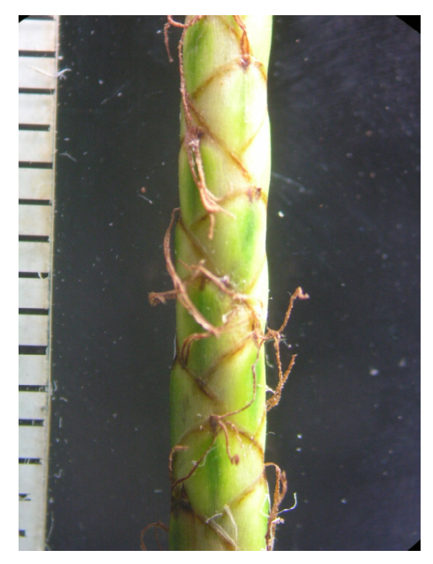
Figure 2: Spikelet of Eleocharis lankana T. Koyama