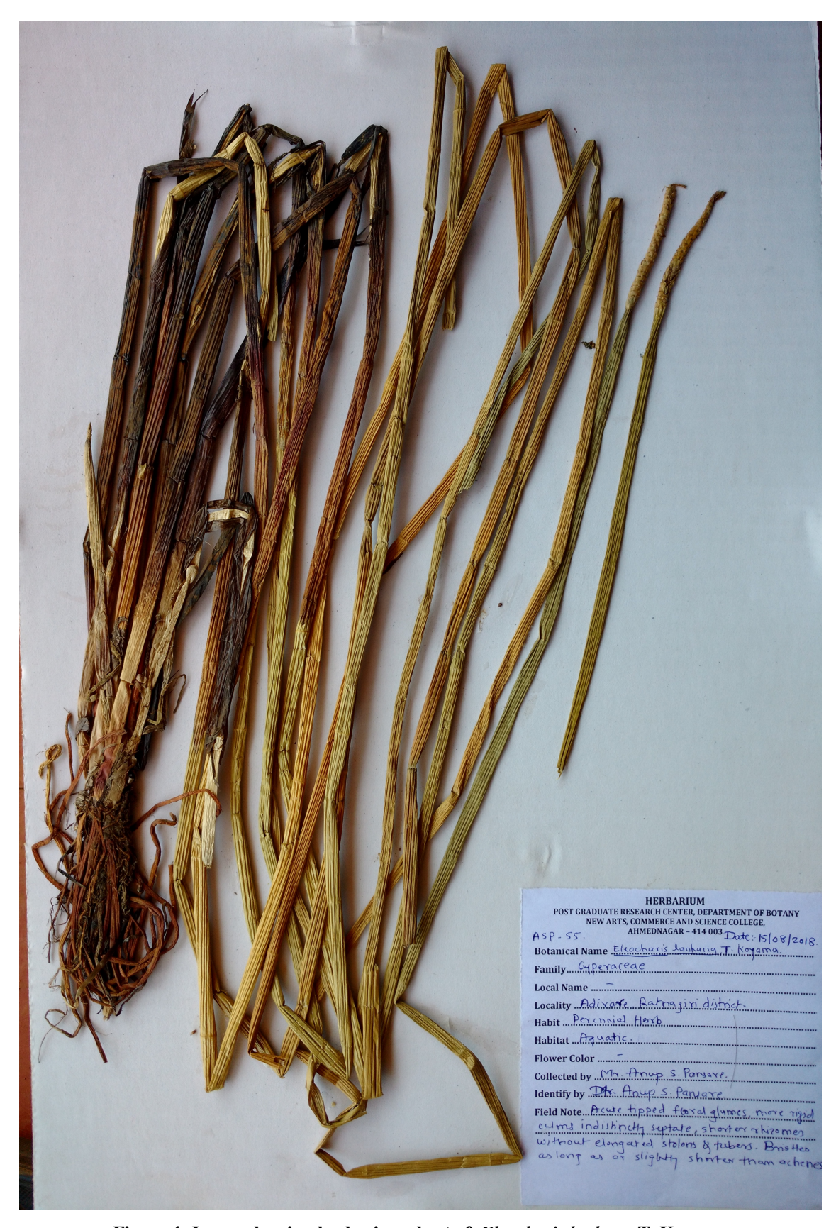
Figure 4: Image showing herbarium sheet of Eleocharis lankana T. Koyama