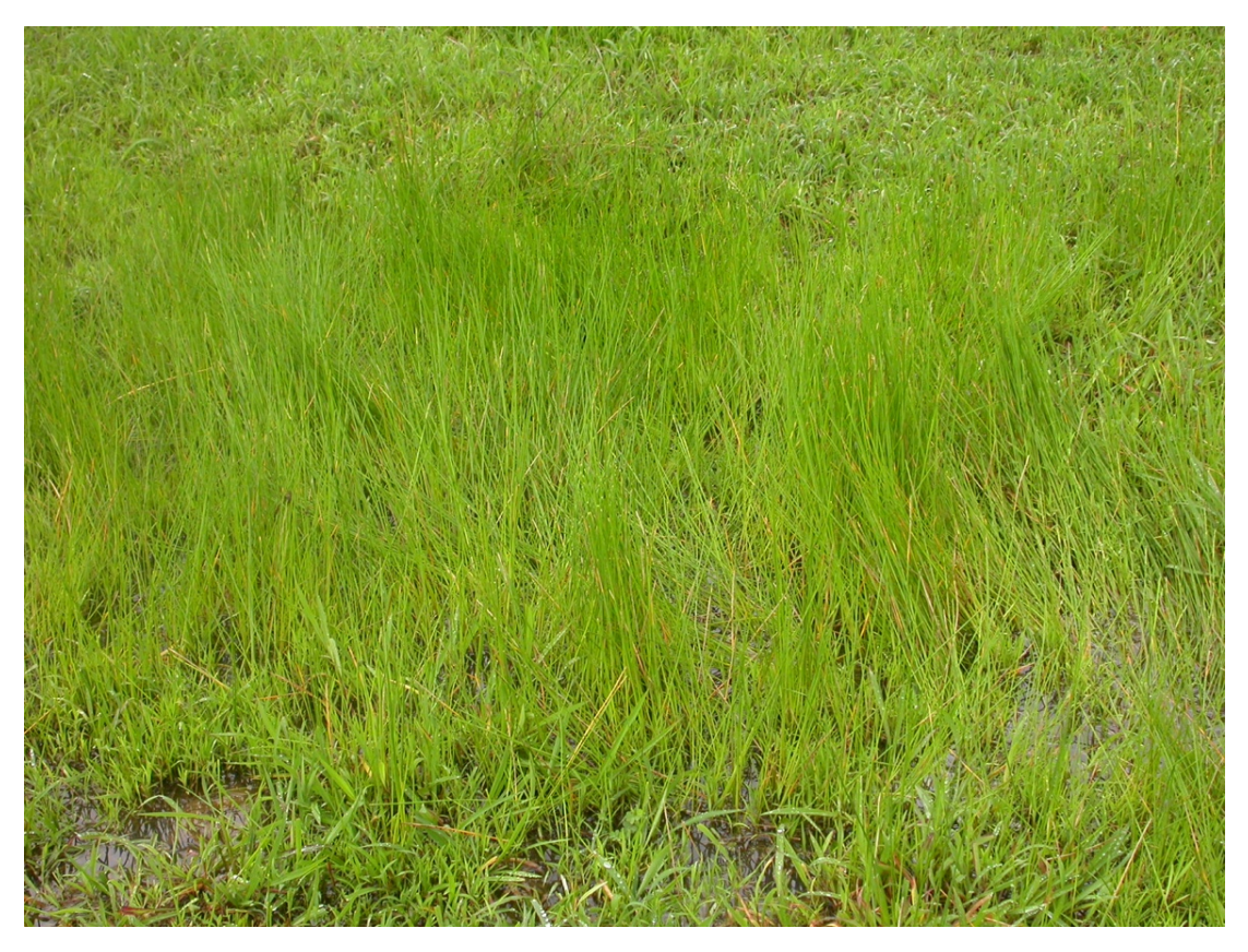
Figure 1: Habitat of Eleocharis lankana T. Koyama