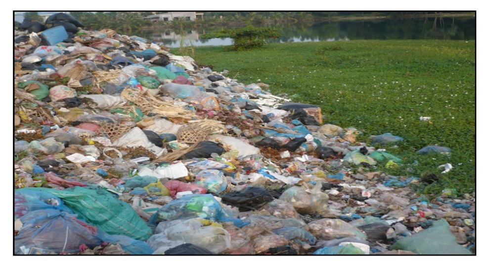
Figure 2. Land and Soil Pollution Due To Openly Discarded Plastic Waste<sup>4</sup>

Land Environment: When plastic is dumped in landfill sites, it comes in contact with water and other hazardous chemicals. Such compounds then can reach the soil and accumulate in the soil. Which affects index properties of soil, reduces fertility of soil and ultimately causes soil pollution.