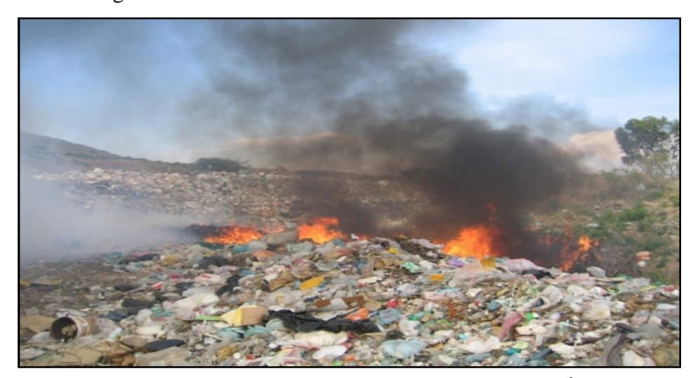
Figure 1. Air Pollution Due To Open Burning Of Plastic<sup>3</sup>

Air Environment: Burning of plastic in the open air and unscientific disposal leads to environmental pollution due to the release of poisonous chemicals<sup>2</sup> which includes dioxins and carbon monoxide. Release of these toxic gases results into ozone depletion, generation of greenhouse gases and global warming.