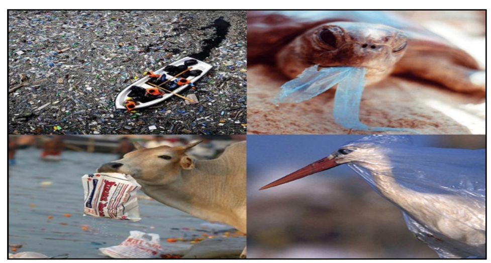
Figure 5. Adverse impact of waste plastic on animals<sup>9</sup>