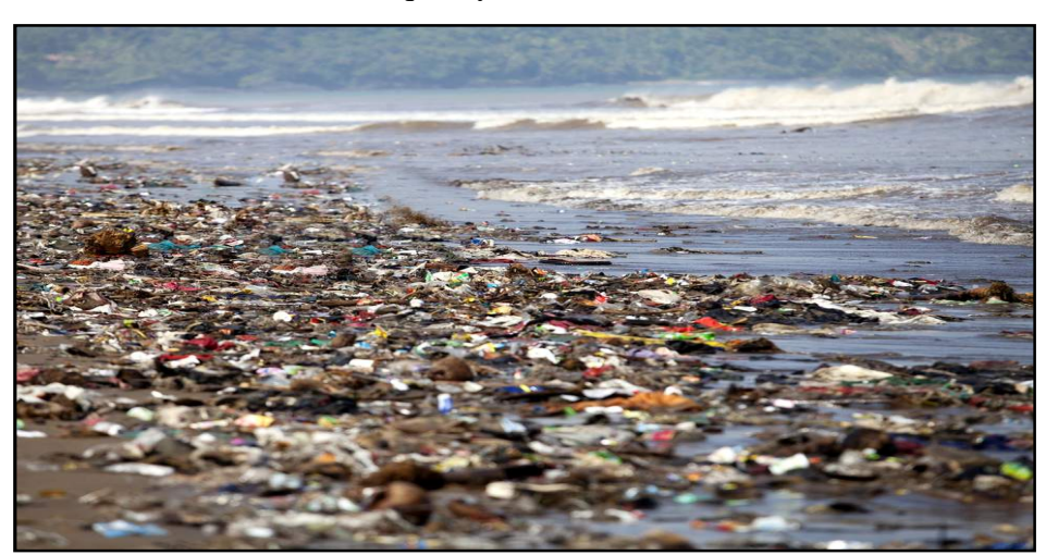
Figure 3. Marine pollution due to plastic waste<sup>5</sup>

contact of oxygen with water also due to consumption of some plastic with food, many marine animals found dead and most have born with deficiencies as they swallow toxic chemicals of plastic. Toxic plastic waste materials also reduce quality of water.