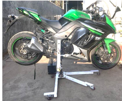
Figure 2: Mounting Based Sky Lifter

This type of sky lifter consists of the following features.