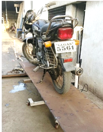
Figure 1: Ramp Based Sky Lifter

This is a unique kind of lifter which is fabricated by us. This system consists of single acting hydraulic cylinder which lifts the ramp up to 2-3 feet height. It also consists of tripod stand which divides the load into 3 parts so that weight distribution is done properly, also consists of industrial rollers which can manoeuvre i.e. the whole system can be moved to and fro and can be rotated. The weight and the cost of the system is much lower than the scissor lifts. The ramp is modular type which can be detachable. The speciality of this skylight is every component is detachable and can be attached by simple bolting, this causes ease of work.