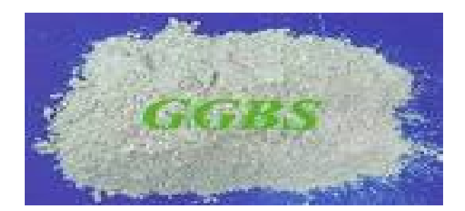
Figure 1. Ground Granulated Blast Furnace slag