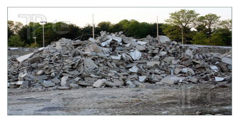
Figure 2.Concrete waste

In India, recent years construction and demolished concrete waste handling and management is the challenging issue faced by several area. Due to strict environmental laws and lack of dumping sites in urban areas, demolished waste disposal is a great problem. It is desirable to completely recycle demolished concrete waste in order to protect natural resources and reduce environmental pollution. The present investigation to be focused on recycling demolished waste materials in order to reduce construction cost and resolving housing problems faced by the low income communities of the India. The crushed construction and demolished concrete wastes is segregated by sieving to obtain required sizes of aggregate, several tests were conducted to determine the aggregate properties before recycling it into new concrete.