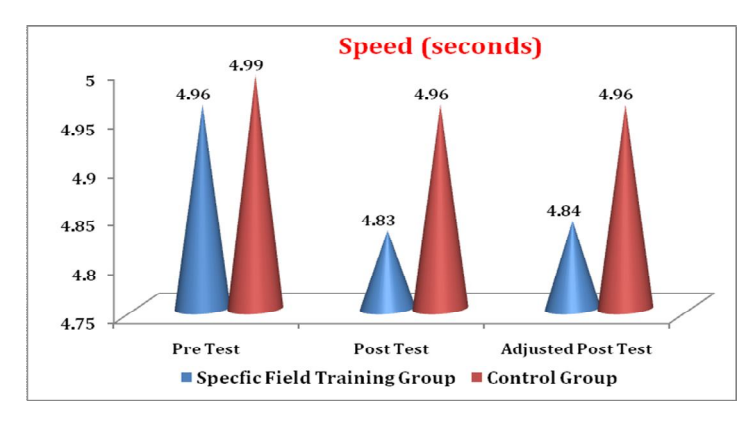
Graph 1: Pre test, post test and adjusted post test mean values of specific field training and control groups on speed.