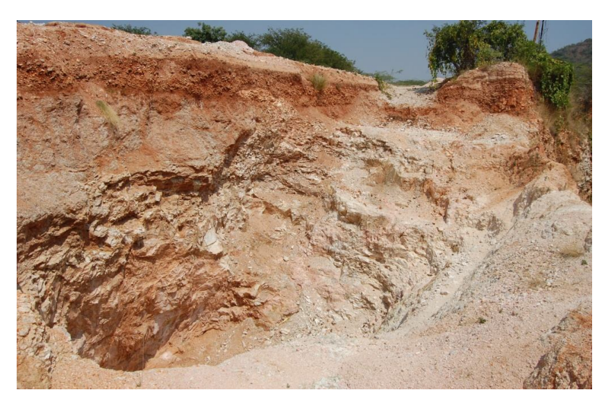
Figure.4: Photograph of Pegmatite mining area.