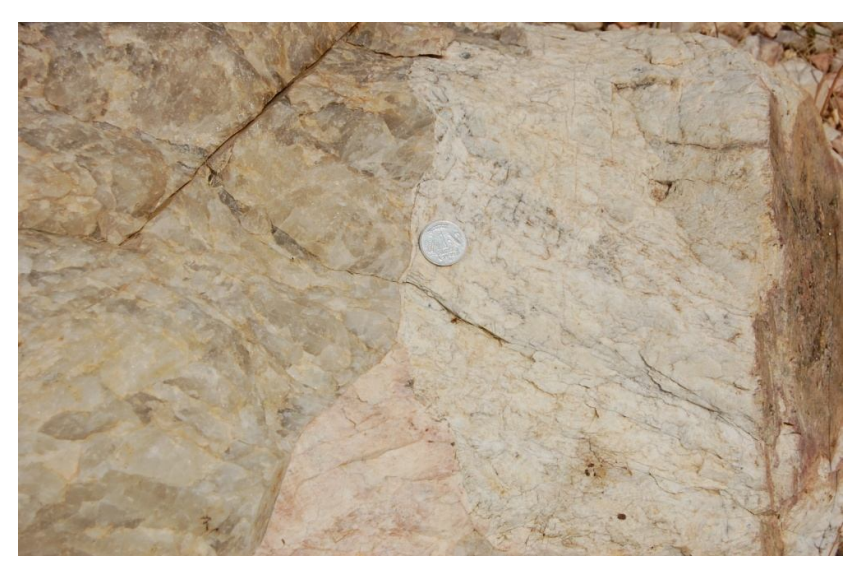
Figure.3: Photograph showing contact between Quartzite and Pegmatite.