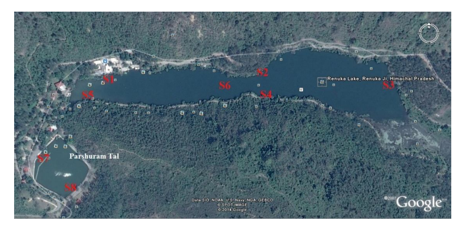
Figure 1. Ariel view of Renuka Lake and Parshuram Tal

Phytoplankton and Physicochemical analysis: Monthly sampling was carried out to collect data on phytoplankton community and selected physicochemical parameters and of the lakes during December 2013 to May 2014. Phytoplankton samples were collected by filtering 100 litre of water through phytoplankton net and preserved in 4% formalin. Further analysis was done in laboratory. Phytoplankton were identified up to the lowest recognizable taxonomic unit mostly genus following keys by <sup>22, 23, 24</sup>. Phytoplanktons were enumerated using Sedgwick-Rafter Cell Counter <sup>25</sup>. Physicochemical parameters were studied following standard methods <sup>25, 26, 27</sup>. Phytoplankton density was subjected to further analysis by applying the Shannon-Wiener species diversity index <sup>28</sup> Margalef (richness) index Evenness index and Palmer index.