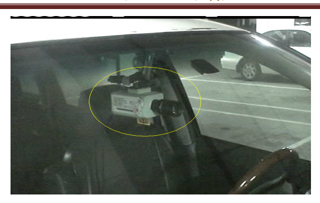
Figure 1. Camera Position In Vehicle

Several instances of real world traffic events are captured in urban, rural and forest areas for assessing the sensitivity of this driver assistance system. Video captured in critical weather conditions like heavy rain is also included, as detection will be a challenging task when the road surface becomes wet and rear lights reflected on it. The parameters of the algorithm is refined and tuned using the performance results of experimental test data. The captured video recording details are shown in table 1.In Table 1, weather condition "Bad" implies the worst atmosphere like mist and so on. "Good" implies better environment and noise free. "Normal" implies better environment with noise.