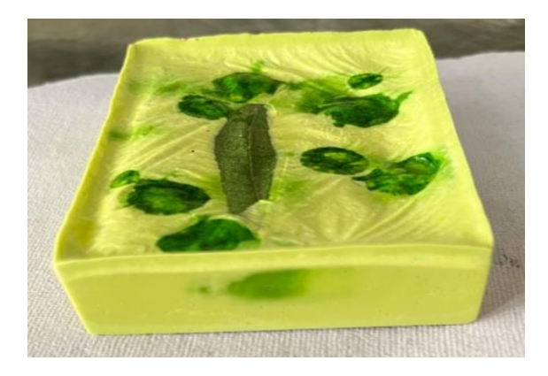
Fig.- 9 Neem soap

Neem is an excellent skin care ingredient. The neem soap is known to relive a dry skin and smooth the skin.