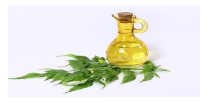
Fig-4: Neem oil

Botanical name of neem: Azadiracta indica