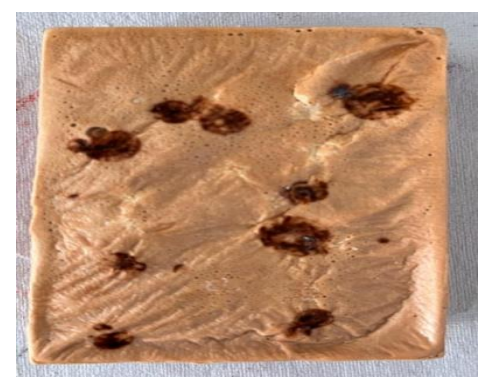
Fig.-11 Almond Soap