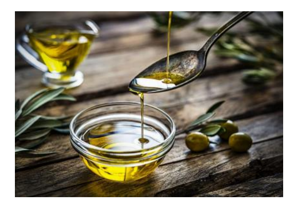
Fig 6: Olive oil

Benefits: Olive oil as a base ingredient due to its deeply moisturising and nourishing properties. Also be used as a pure body oil, hair treatment, or natural soap which can help to relieve dry skin and