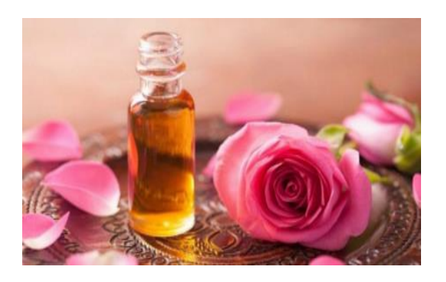
Fig-7: Rose oil