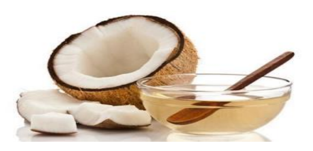
Fig 5: Coconut oil