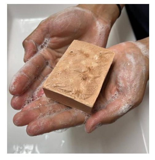
Fig 2:- Saponification