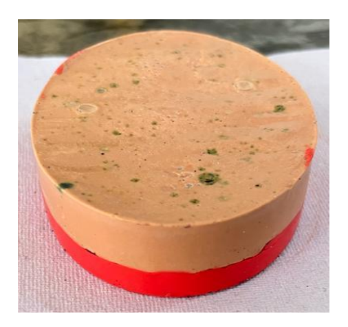
Fig.-12 Rose Almond Soap