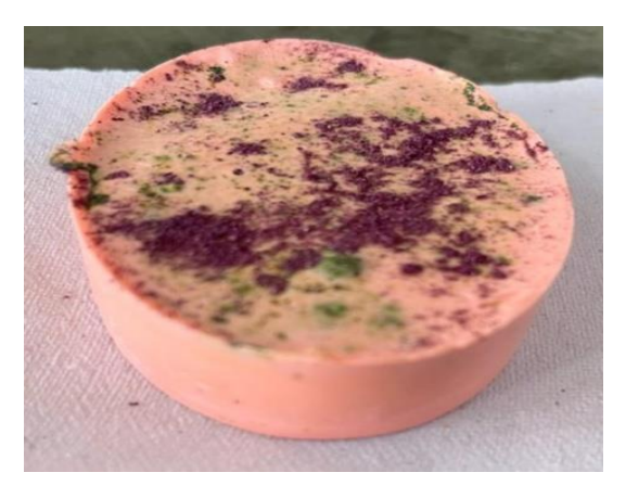
Fig.-10 Rose Soap